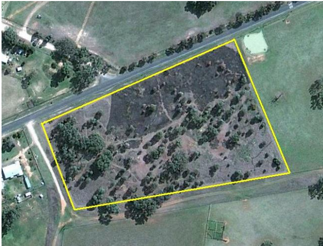
Aerial Photo of Adams Lead Reserve